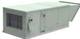
Make Up Air Unit