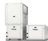
Water Source Heat Pumps