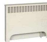
Wall Panel Heater